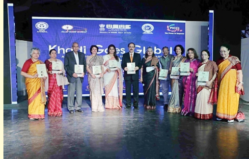
Release of Compendium "Khadi Goes Global" at National Event, New Delhi in February 2019