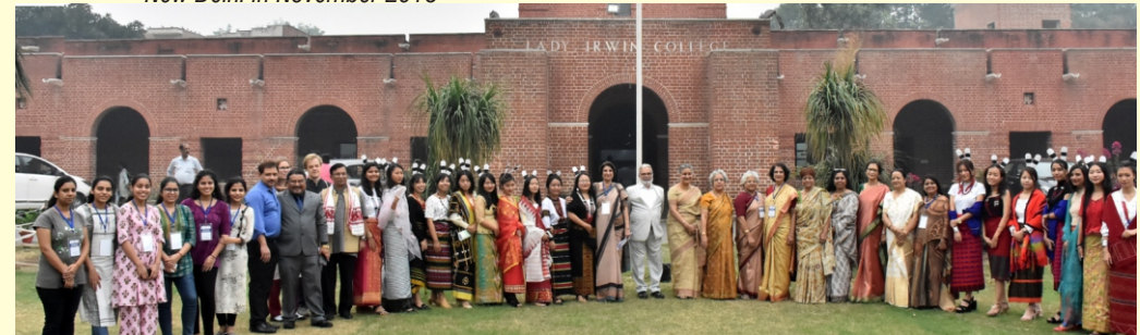
North East Expo & Fashion Walk held at LIC-2019