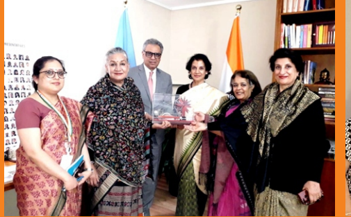
"Khadi Goes Global" at Side Event CSW63, UN HQs. New York in March 2019

Release of compendium "A World We Women Want" at CSW60 at UN H.Qs. New York-2016