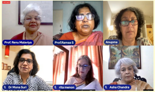
Webinar No. 2 of National Webinar Series of 5 on SLD-Dyslexia, April 2022

National Webinar Series, January-February 2022