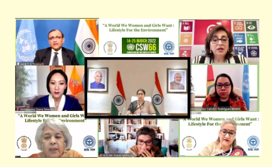
CSW66: A virtual event " A World We Women Want; Lifestyle For the Environment", March 2022