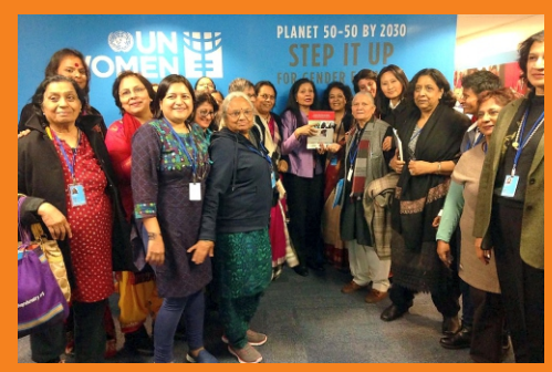
Release of compendium "A World We Women Want" at CSW60 at UN H.Qs. New York-2016

In May 1999, AIWEFA was granted ECOSOC status – NGO in Special Consultative Status with the Economic and Social Council of the United Nations. This has provided AIWEFA with an opportunity to generate and sustain international and national concerns through consultation, cooperation and coalition in the larger international arena of the United Nations. The last few years have witnessed a visible AIWEFA presence at international fora.