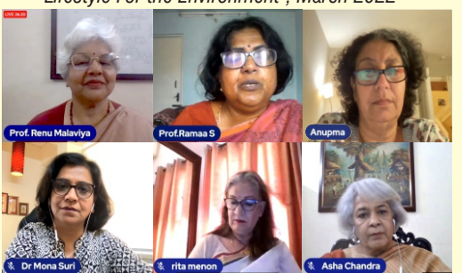
Webinar No. 2 of National Webinar Series of 5 on SLD-Dyslexia, April 2022