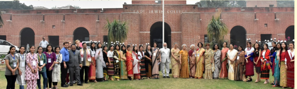
North East Expo & Fashion Walk held at LIC-2019