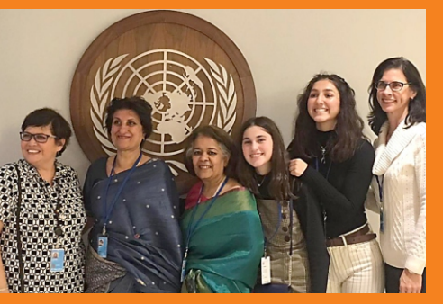
AIWEFA and other participants at Side Event, CSW63 at UN Hqs., New York-2019