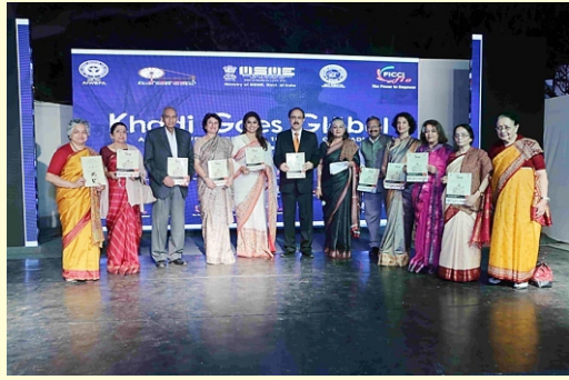
Release of Compendium "Khadi Goes Global" at National Event, New Delhi in February 2019