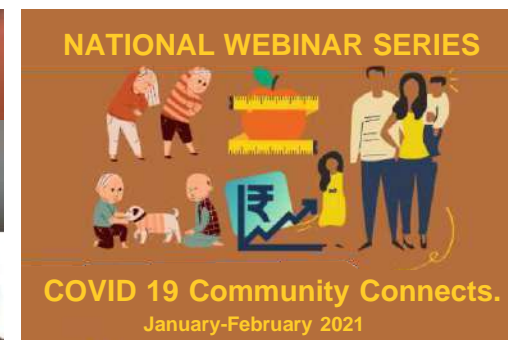
National Webinar Series, January-February 2021