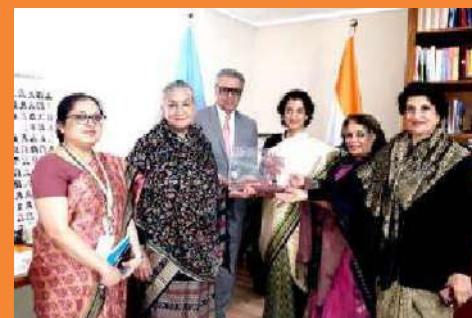
AIWEFA team with Indian Ambassador to UN, His Excellency Mr. Syed Akbaruddin at CSW63, UN HQs. New York in March 2019