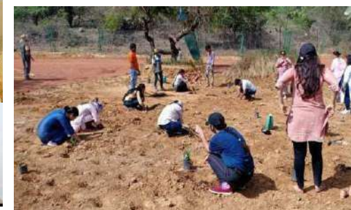
Plantation drive in the Asola Bhatti Wildlife Sanctuary in the Aravali range, South Delhi. A joint project of AIWC, AIWEFA & LIC