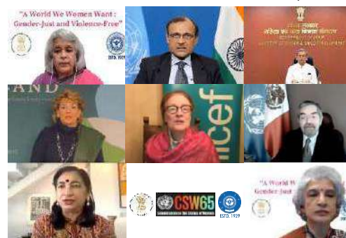
CSW65: A virtual event "A World We Women Want; Gender Just & Violence Free", March 2021