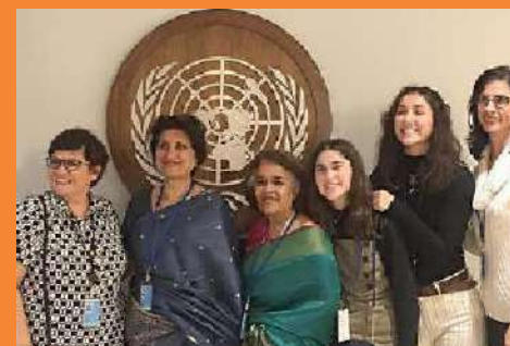
AIWEFA and other participants at Side Event, CSW63 at UN Hqs., New York-2019