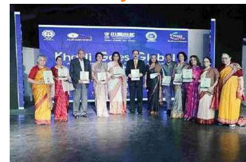
Release of Compendium "Khadi Goes Global" at National Event, New Delhi in February 2019