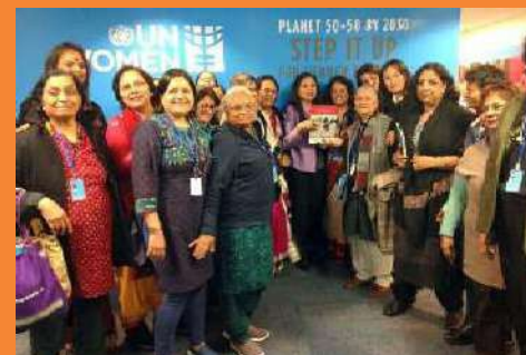
Release of compendium "A World We Women Want" at CSW60 at UN H.Qs. New York-2016

In May 1999, AIWEFA was granted ECOSOC status – NGO in Special Consultative Status with the Economic and Social Council of the United Nations. This has provided AIWEFA with an opportunity to generate and sustain international and national concerns through consultation, cooperation and coalition in the larger international arena of the United Nations. The last few years have witnessed a visible AIWEFA presence at international fora.