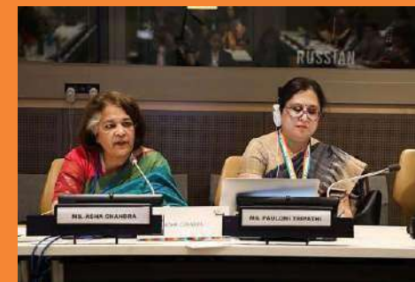
"Khadi Goes Global" at Side Event CSW63, UN HQs. New York in March 2019