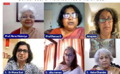
Webinar No. 2 of National Webinar Series of 5 on SLD-Dyslexia, April 2022