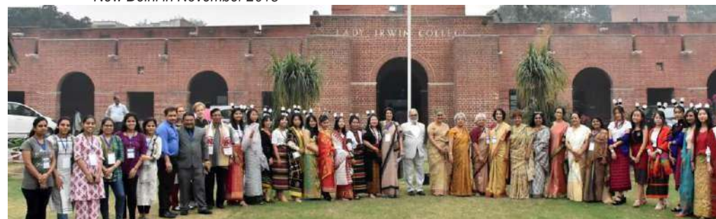
North East Expo & Fashion Walk held at LIC-2019