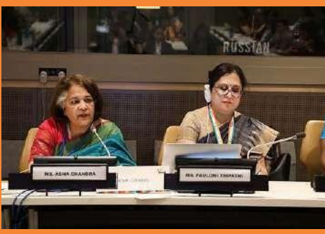
"Khadi Goes Global" at Side Event CSW63, UN HQs. New York in March 2019