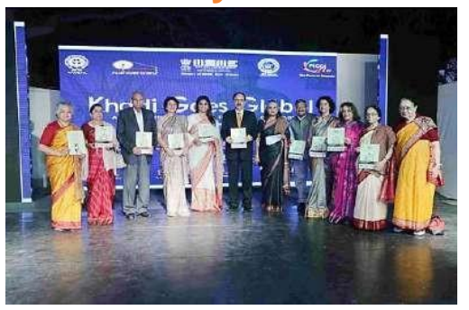
Release of Compendium "Khadi Goes Global" at National Event, New Delhi in February 2019