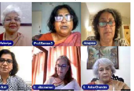
Webinar No. 2 of National Webinar Series of 5 on SLD-Dyslexia, April 2022