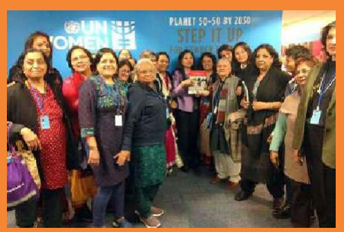
Release of compendium "A World We Women Want" at CSW60 at UN H.Qs. New York-2016

In May 1999, AIWEFA was granted ECOSOC status – NGO in Special Consultative Status with the Economic and Social Council of the United Nations. This has provided AIWEFA with an opportunity to generate and sustain international and national concerns through consultation, cooperation and coalition in the larger international arena of the United Nations. The last few years have witnessed a visible AIWEFA presence at international fora.