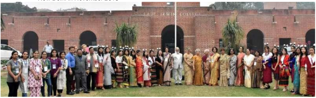
North East Expo & Fashion Walk held at LIC-2019