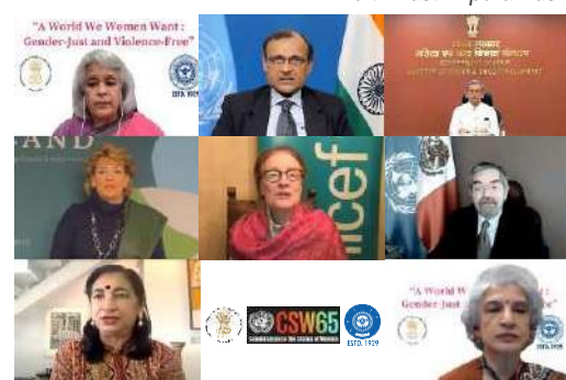
CSW65: A virtual event " A World We Women Want; Gender Just & Violence Free", March 2021