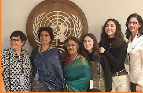
AIWEFA and other participants at Side Event, CSW63 at UN Hqs., New York-2019